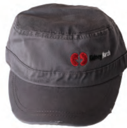
Military Cap $20.00