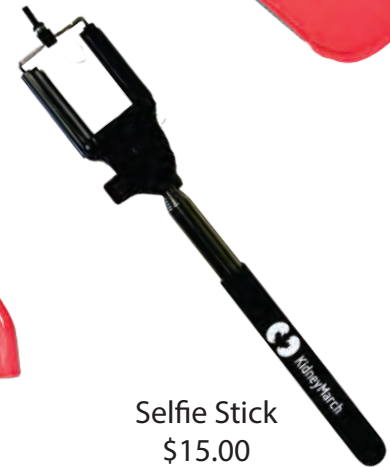
Selfie Stick $15.00

TO PLACE YOUR ORDER, PLEASE CONTACT Carol Rigg-Rembish at 403-255-6108 ext 24 or carol.rigg-rembish@kidneyfoundation.ab.ca