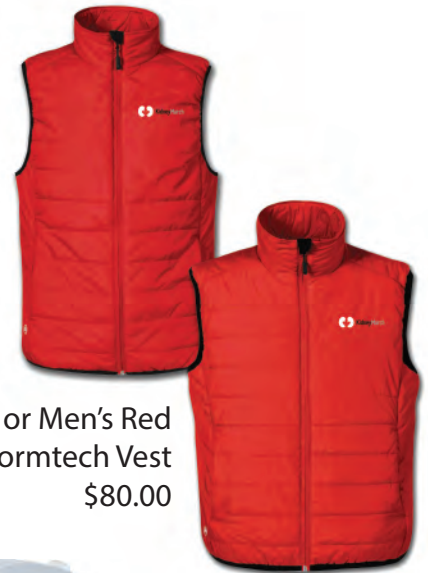
Ladies or Men's Red Stormtech Vest $80.00