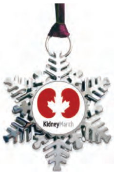
Kidney March Snowflake Ornament $15.00