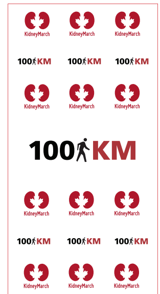
White/Red Tubers $15.00

TO PLACE YOUR ORDER, PLEASE CONTACT Carol Rigg-Rembish at 403-255-6108 ext 24 or carol.rigg-rembish@kidneyfoundation.ab.ca