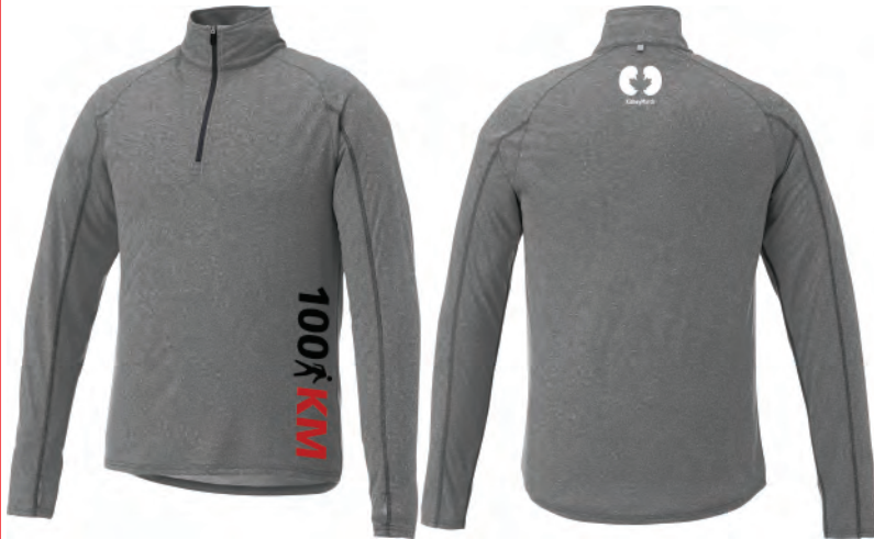
Ladies or Men's Taza 1/4 Zip Pullover $60.00