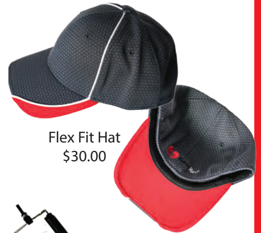
Flex Fit Hat $30.00