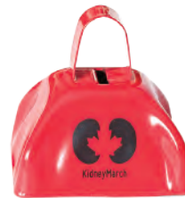
Cow Bell $5.00