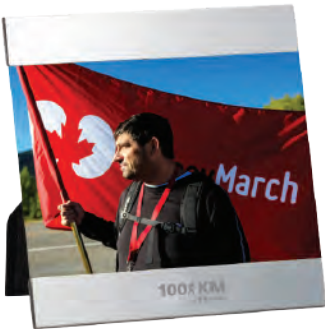
Aluminum 4" x 6" Frame $10.00