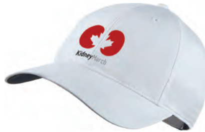
Nike Racing Cap White, Adjustable $35.00